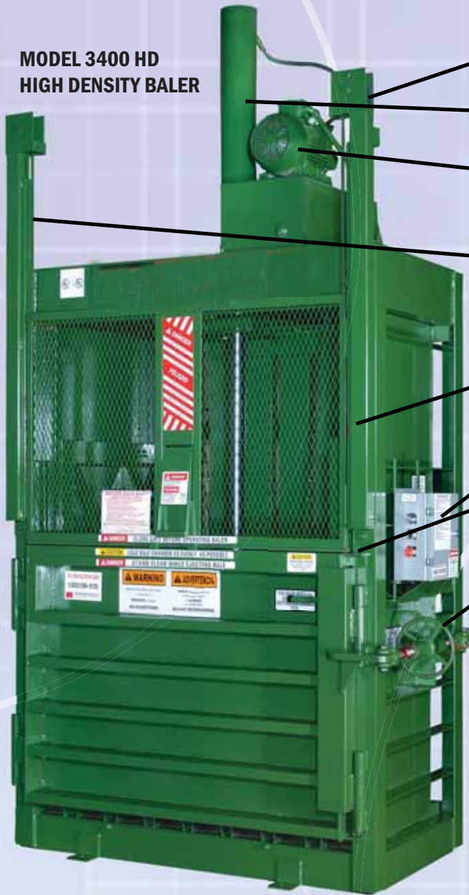
MODEL 3400 HD HIGH DENSITY BALER

CONCEALED PROXIMITY safety switch prevents automatic operation unless the gate is fully closed, and reduces operator influence.